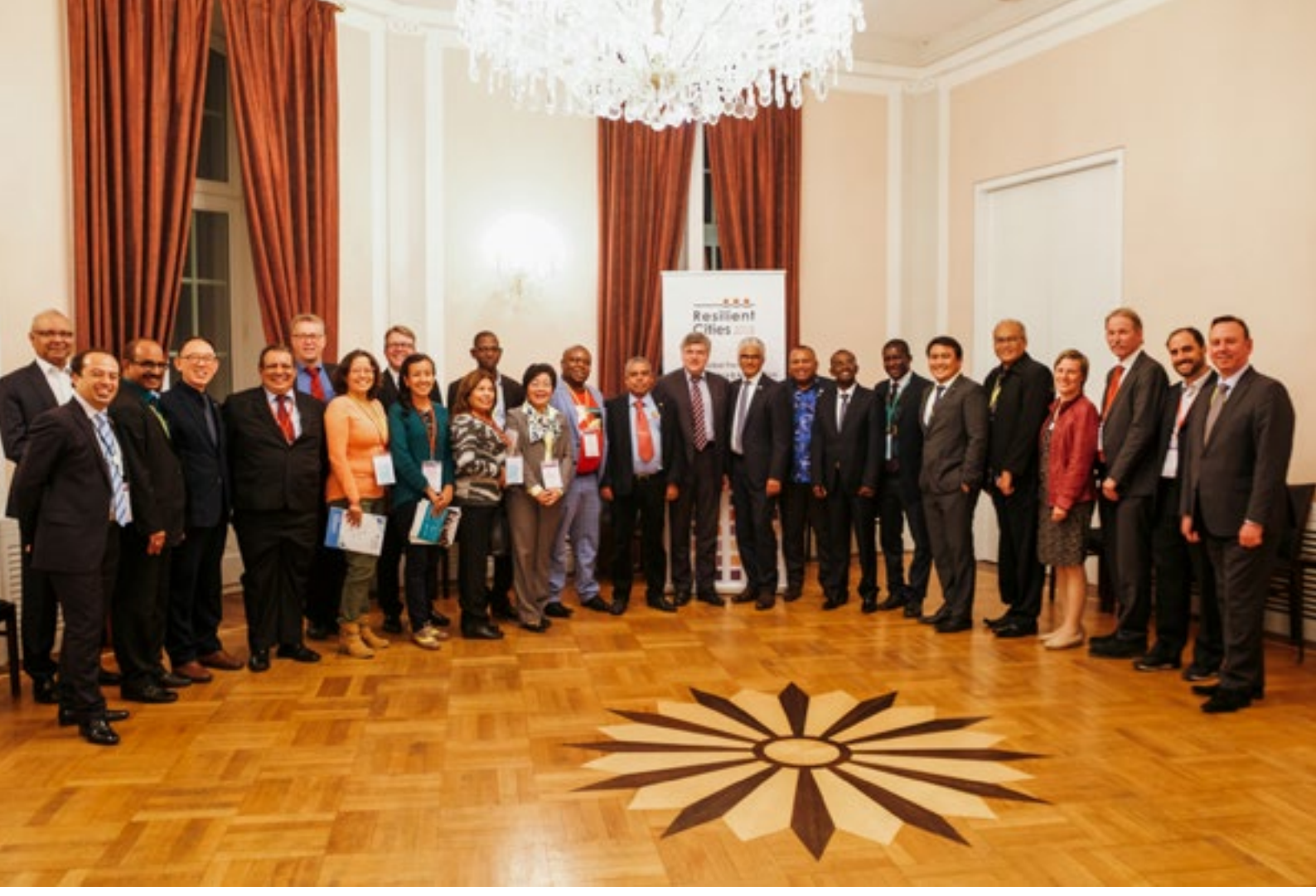
Cities and Regions Talanoa Dialogue at Resilient Cities 2018 in Bonn, Germany