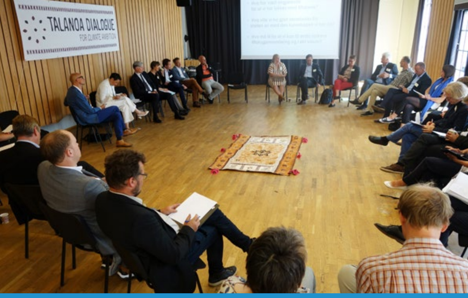
Participants at a Cities and Regions Talanoa Dialogue event in Norway