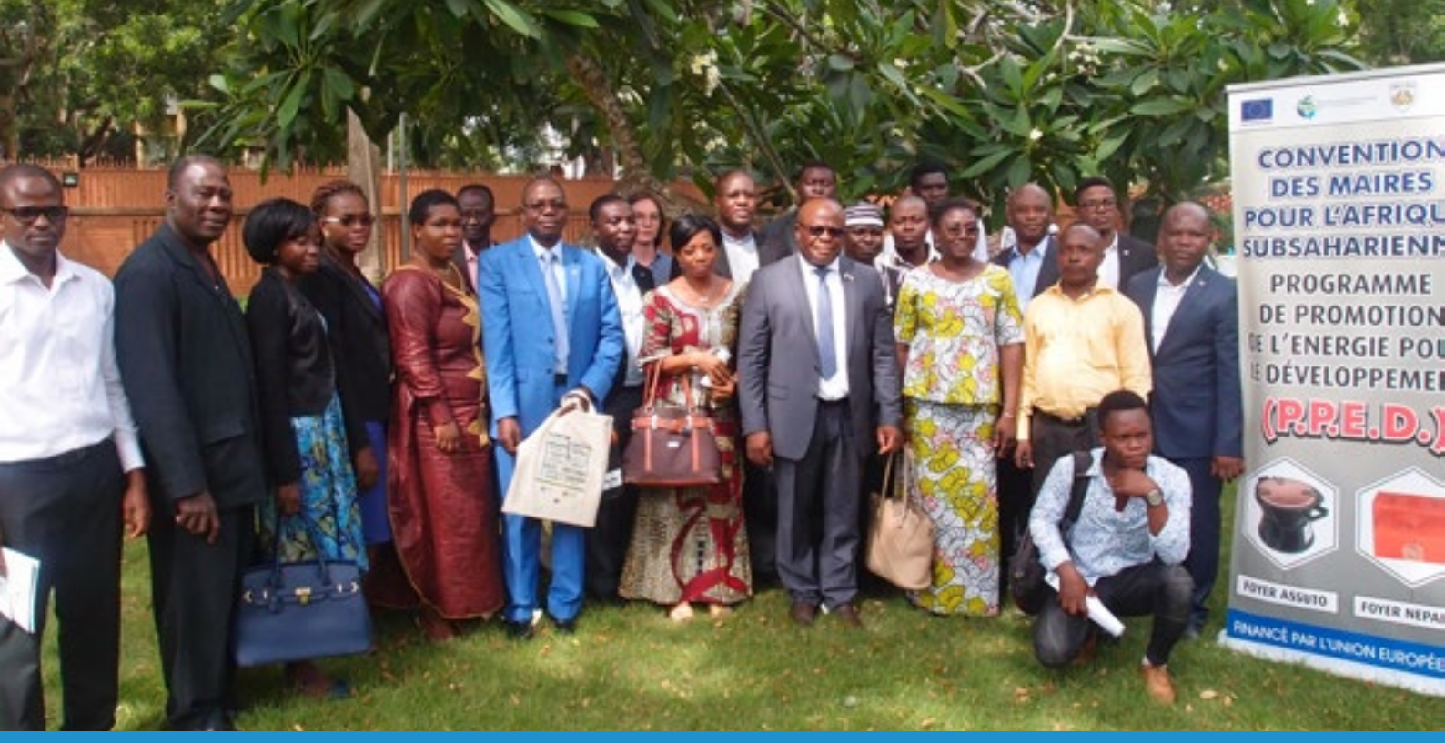
Participants at the Lomé Talanoa Dialogue in Togo