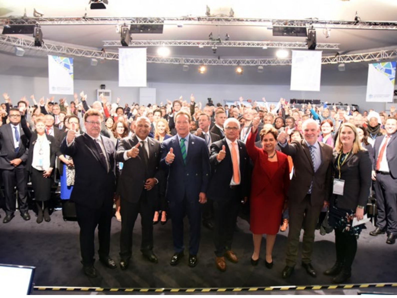
Leaders at the closing plenary of the COP23 leaders summit

In short, the Cities and Regions Talanoa Dialogues open channels for sharing resources, knowledge and responsibility across governments at all levels.